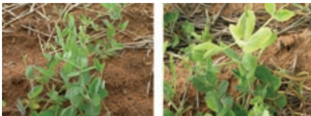
Figure 2. Crop yellowing in peas following a post-emergent herbicide application; comparison of unsprayed (a) and sprayed (b) plants.

Transient crop yellowing of legumes, 2-3 weeks following post-emergent herbicide applications, is a common phenomenon (Figure 2). In the Mallee, a relationship has been identified between crop yellowing (peas) and nodule number following herbicide application. The more severe the crop yellowing (intensity and percentage of crop effected), the more likely a reduction in nodule number, and consequently N 2 fixation.