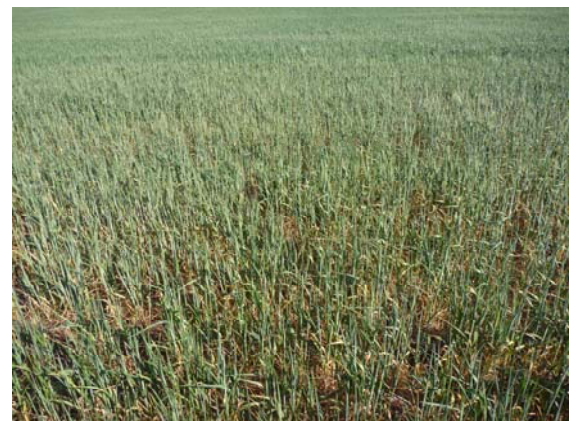
Two new MSF core trial sites have been established at Karoonda and Duyen as part of the Water Use Efficiency Project. These photos from show examples of dune (left) and swale (right) at Duyen.