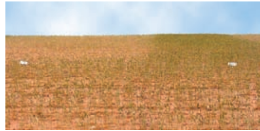
Figure 2. Site 07, Copeville, SA. The left plot is the untreated control; the right plot is where innocent weed was controlled for the whole summer.