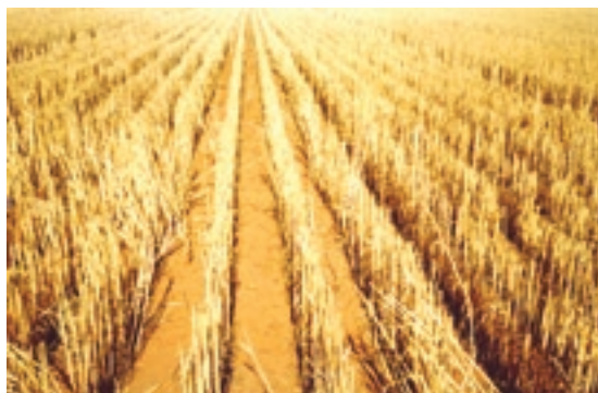
Figure 1: Stubbles are a readily available source of carbon for Mallee soils.

Microbial populations in the Mallee are crying out for carbon. By growing more crops and retaining as much stubble as possible we can maximise the amount of carbon returned to the soil, leading to an increase in microbial functions.